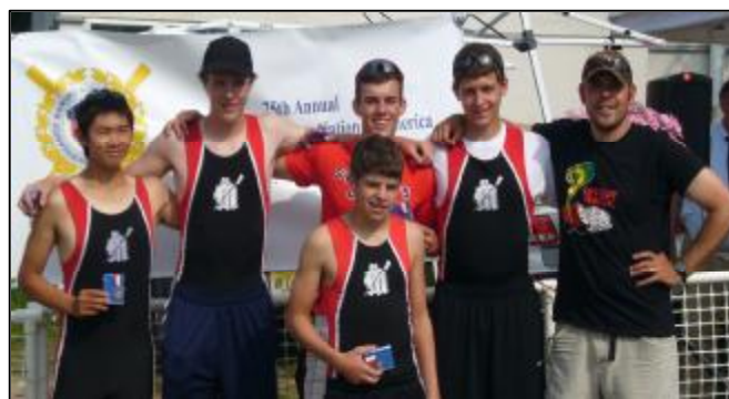
MJ4+ SRAA NATIONALS, 2 ND PLACE, OLSM

The semi-finals were good to OLSM and all boats advanced. But this time the finishes were ML4+ 3 rd , MS4+ 2 nd , and of course the MJ4+ a strong 2 nd . Like I said all event long.