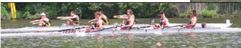
CLOCKWISE FROM TOP: MS4+, ML4+, MJ4+